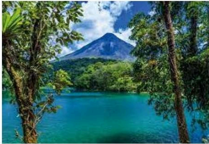
Spanish Department trip to Costa Rica