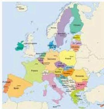
Social Studies Department European trips