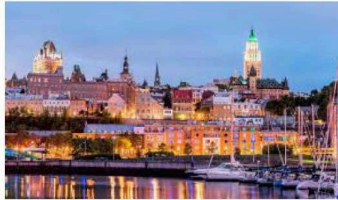
French Department trip to Quebec