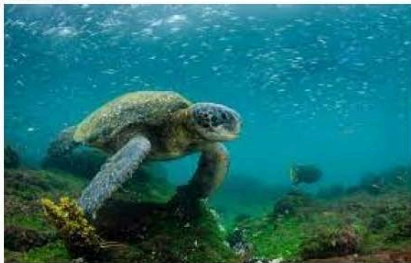
Charting the Galápagos Islands - Ecuador